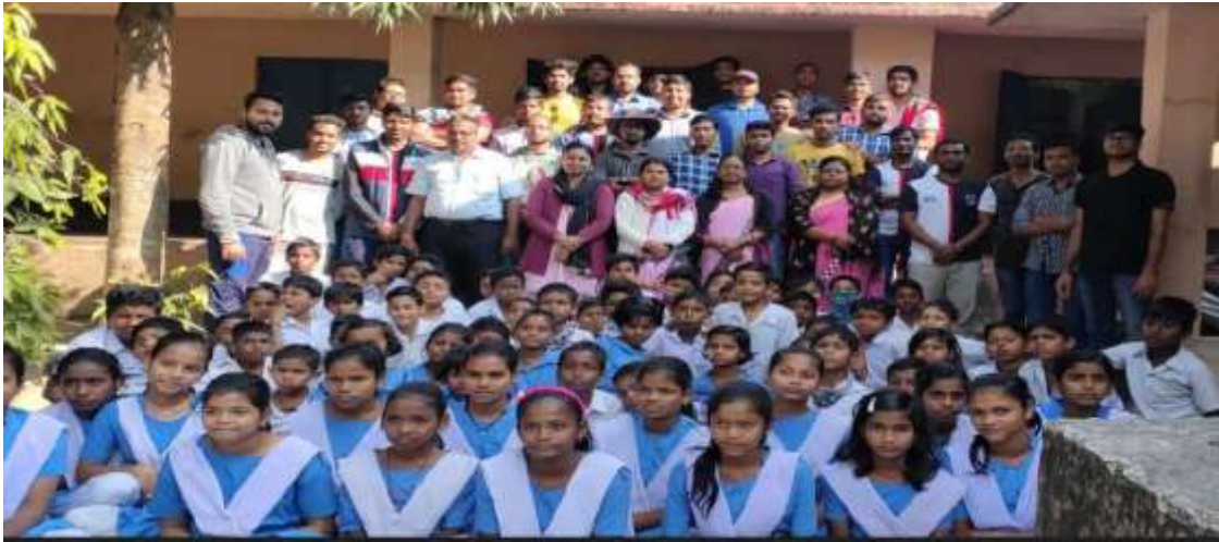
Visiting of Schools during Multicultural exposure